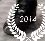
Tom Bale - UK